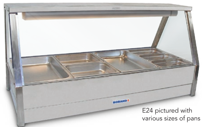
E24 pictured with various sizes of pans